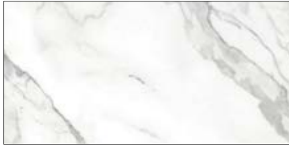
30 x 60 cm (12 x 24) GE.AR.WHT.1224.PL