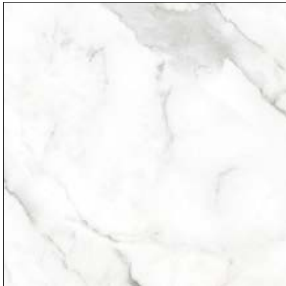
60 x 60 cm (24 x 24) GE.AR.WHT.2424.PL