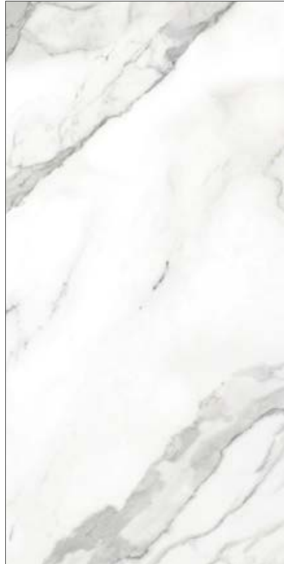
60 x 120 cm (24 x 48) GE.AR.WHT.2448.PL

* It is recommended to seal polished porcelains with a penetrating sealer prior to grouting. Please see our selection of MORE Surface Care Products.